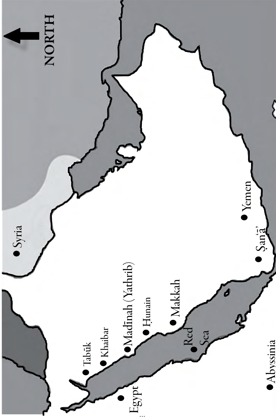
ARABIA CIRCA 700 A.D.